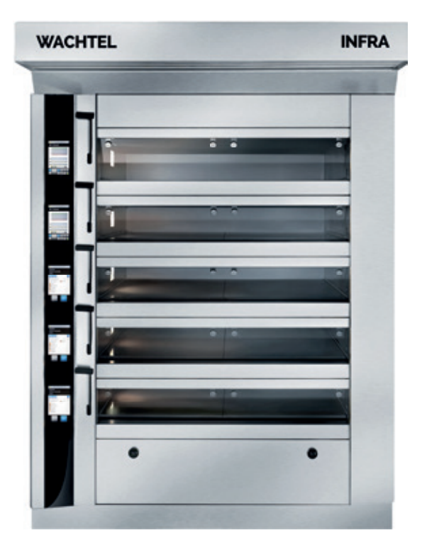
INFRACE for production

INFRA CE CLASSIC Black with IQ TOUCH and ANALOG control Up to 12 m<sup>2</sup> total baking area with 5 decks