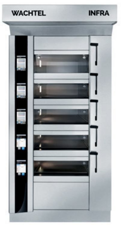
INFRA AE 516/48 4.8 m² baking area

Single-width: Singularly brilliant as a back-up oven - Deck width: 60 cm -