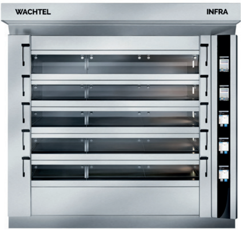
INFRA EE 520/180 18 m² baking area

All good things come in threes (triple-width): - Deck width: 1.8 m -