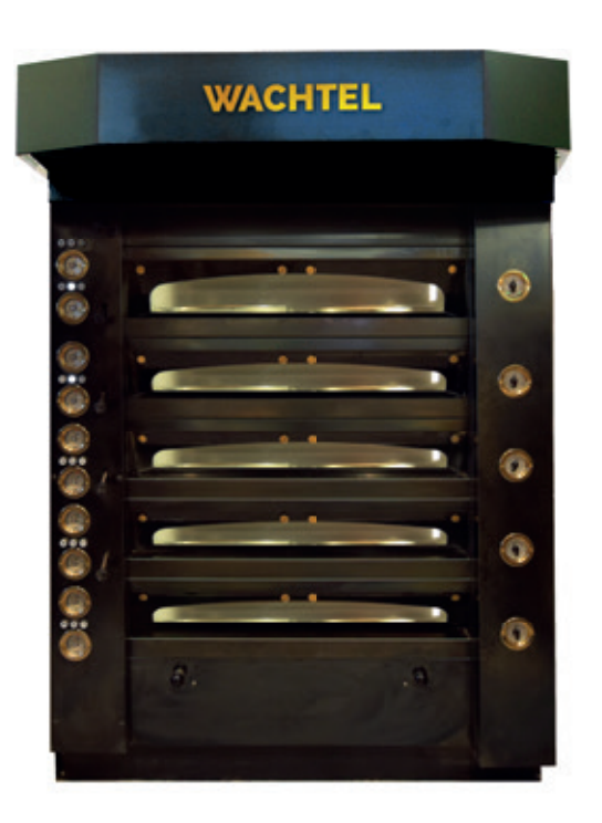
INFRA CE CLASSIC for the store