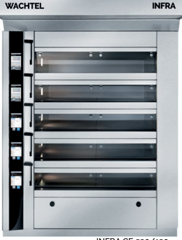
INFRA CE 520/120 12 m² baking area

Double-width: The best-seller in its class - Deck width: 1.2 m -